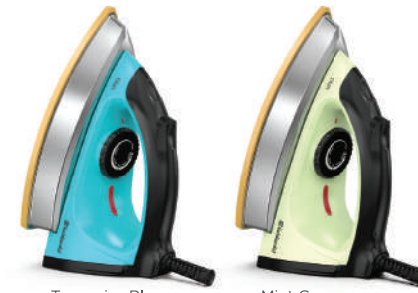
Turquoise Blue Mint Green