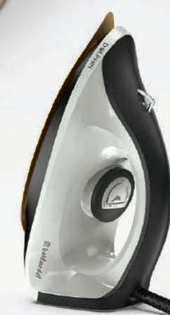
Cool Grey Black