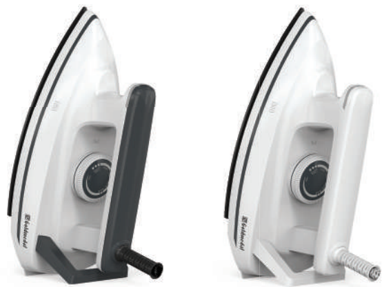
White Grey White